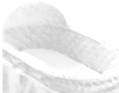
For a "Child" is born to us, a Son given

God first entered the world with a history of the; " Word's " full power! His knowledge, where he ordains signs in the heaven, foretells the future, and reveals certain mysteries. Genesis went on to show the Sun in the skies arise shine, came to the "Source" God Himself, proclaiming his marvelous works. The moon marks months, rules the Feast Days , special celebration days for you of His superb works. The stars beautify the skies. No escaping the rainbow! Laying superbly for all to see. Everything has its purpose. Much more important, Yeshua reveals he is the means by which God is communicated to humans.